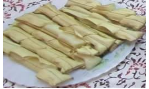
Figure 3: Leppe-leppe