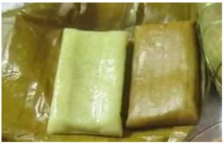
Figure 1: Burasak

Indirectly, their traditional food is a recognition of the community to the outside world. Bugis traditional foods that are commonly found in Johor are burasak, lepat loi, barongko, bejabuk (serunding) and nasu mettih (asam pedas ikan parang). The food is a must for the Muslim Bugis people during their gatherings. Based on the above notions, various thoughts and opinions related to traditional foods can be evaluated (Fitrisia et al., 2018).