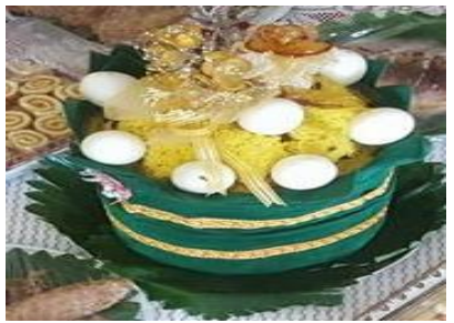
Figure 4: Sessok