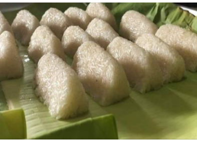
Figure 2: Lepat loi